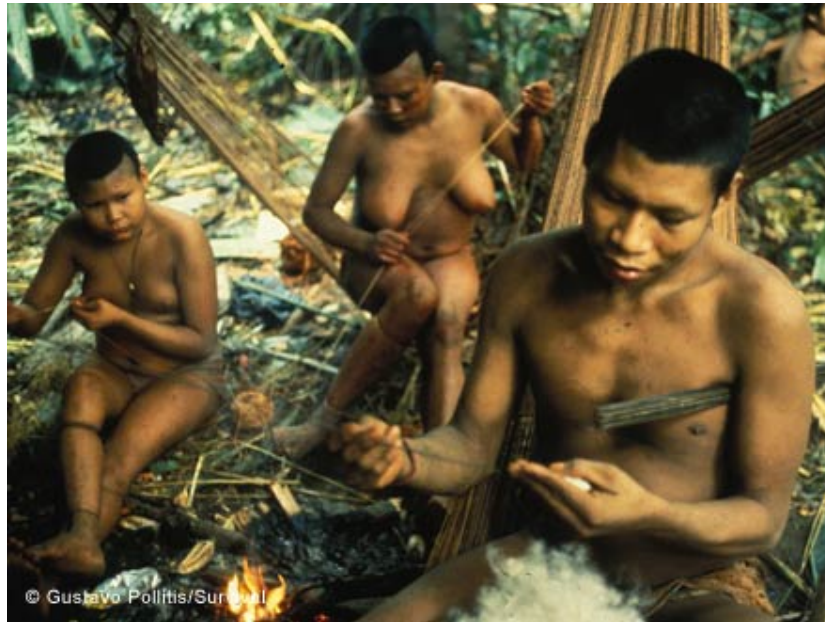
Figure 1.2 The Nukak, a surviving hunter gatherer society in the Colombian rain forest.

limit. That is why there has been plenty of room for African living standards to fall in the years since the Industrial Revolution.