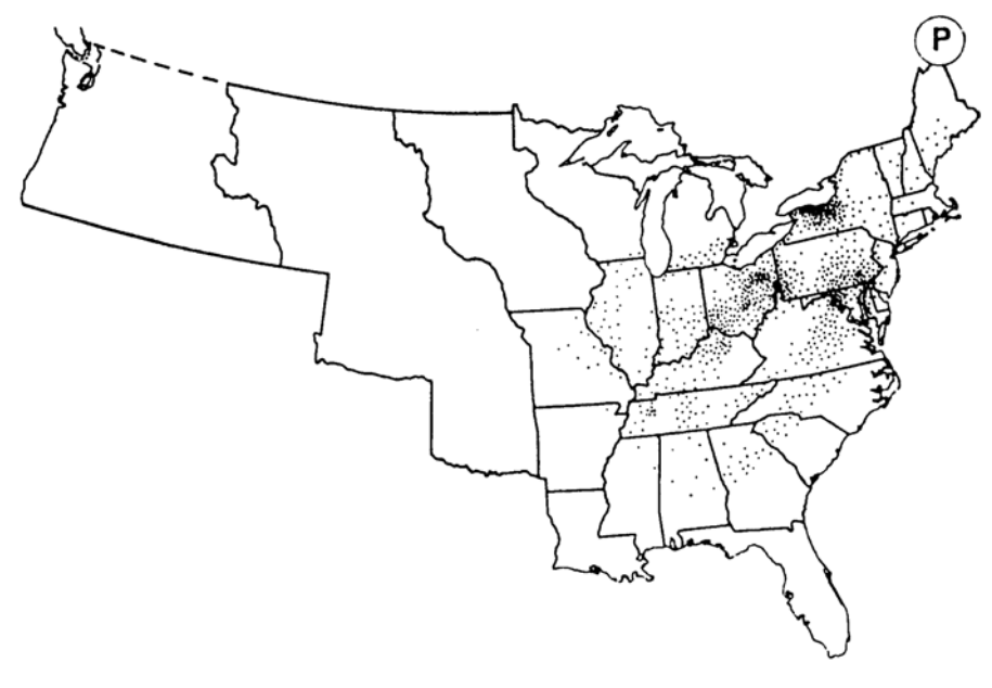
FIGURE 2A WHEAT PRODUCTION, 1839

Note : Each dot represent 100,000 bushels.